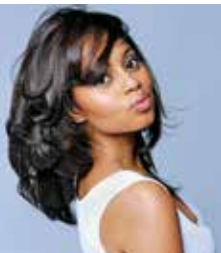
Twists or Knots